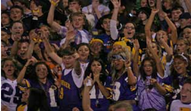
It's not just the athletes who go "ALL OUT" for the games!