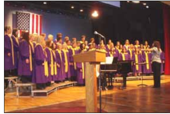
Choir performs at Veteran's Day Program