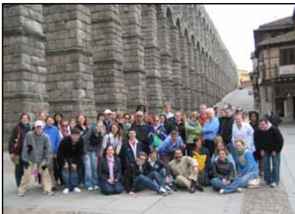
Trip to Spain, including tours and local family stays.

95 percent of graduates plan on continuing their education. Eighty-eight percent plan to attend four year colleges or universities and eight percent plan to enroll in junior colleges and vocational/technical schools